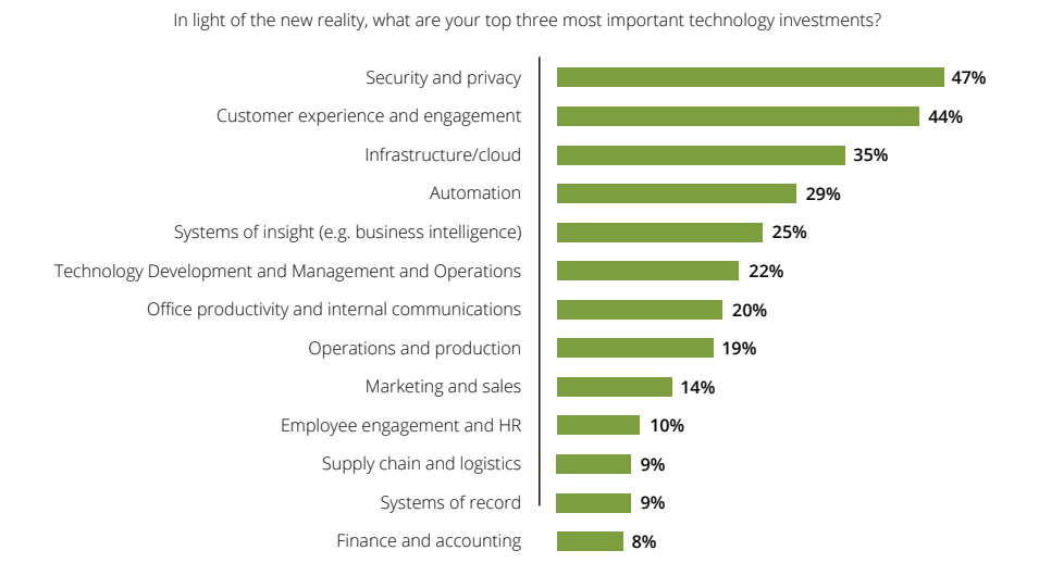
Figure 1: Responses to question on Top 3 Most important technology investments.

It's no surprise, then, that security concerns are on the minds of enterprise IT and security teams that are relying upon the edge. In a survey of 268 IT execs, <u>55 percent said edge devices</u> were not built with security in mind, and 69 percent said network security has already been or will be affected as a result of edge computing.